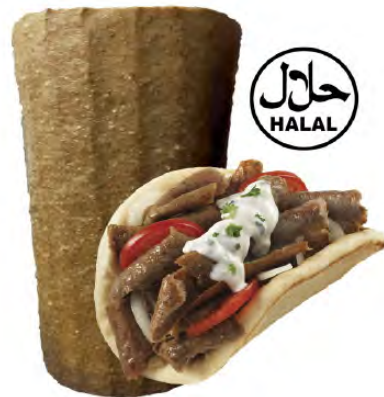
Halal Gyro Cone 20lb Case #2410204