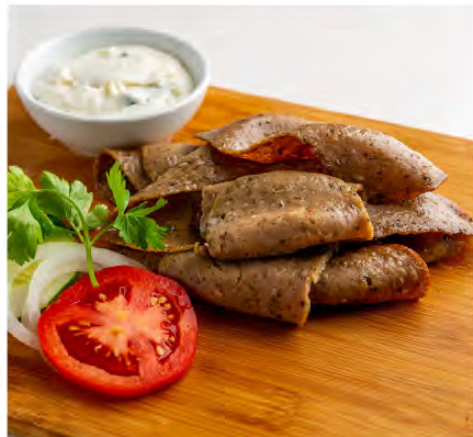
Gyro Slices 5lb Case #79479

AWARD WINNING PRODUCTS AVAILABLE AT RESTAURANT DEPOT! FOR RECIPE IDEAS, VISIT WWW.DEVANCOFOODS.COM