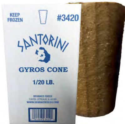
Santorini Gyro Cone 20lb Case #167251