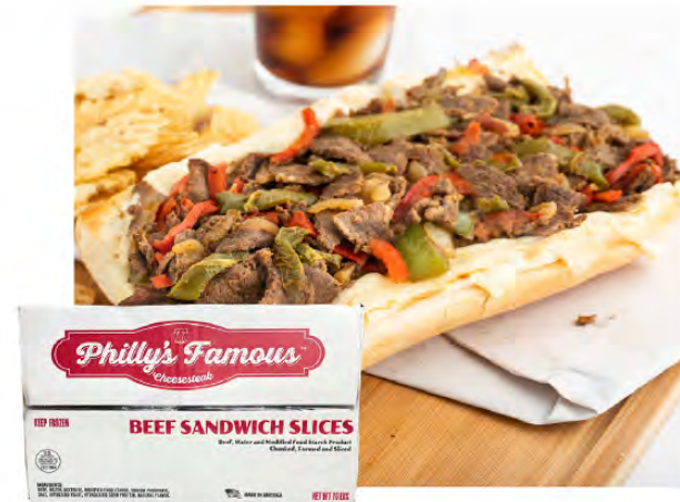
Beef Steak Sandwich Slices 10lb Case #340267